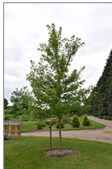
Matador Maple