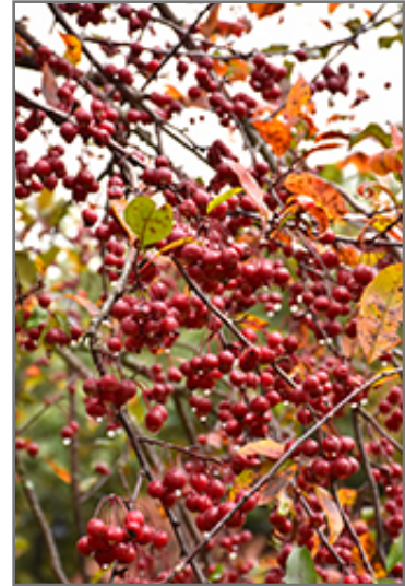
Prairifire Flowering Crab fruit

This tree should only be grown in full sunlight. It prefers to grow in average to moist conditions, and shouldn't be allowed to dry out. It is not particular as to soil type or pH. It is highly tolerant of urban pollution and will even thrive in inner city environments. This particular variety is an interspecific hybrid.