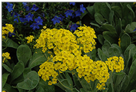
Basket Of Gold Alyssum flowers