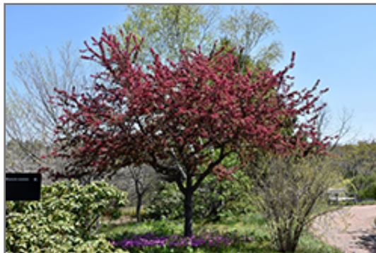
Adams Flowering Crab in bloom