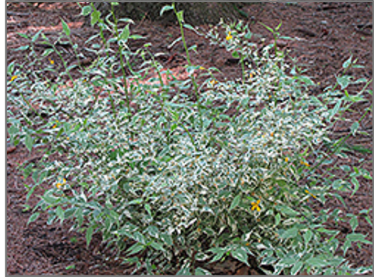
Picta Japanese Kerria

* This is a 'special order' plant - contact store for details