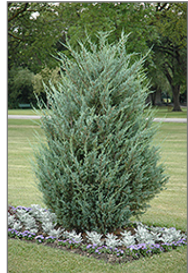
Moonglow Juniper