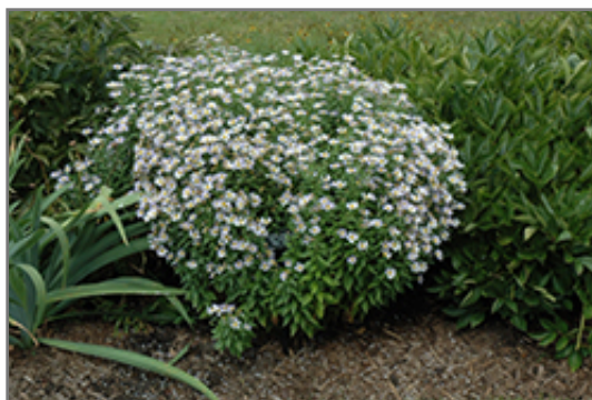
Jim Crockett Boltonia in bloom