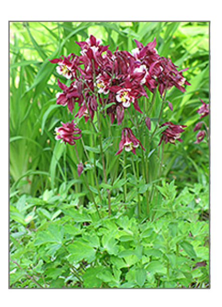
Red Hobbit Columbine flowers

Elegant deep scarlet flowers with creamy white edged cups and interesting spurred petals rise over the medium green delicate foliage; a wonderful addition to border edges or massed in the garden; will tend to self seed