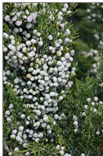
Fairview Juniper fruit