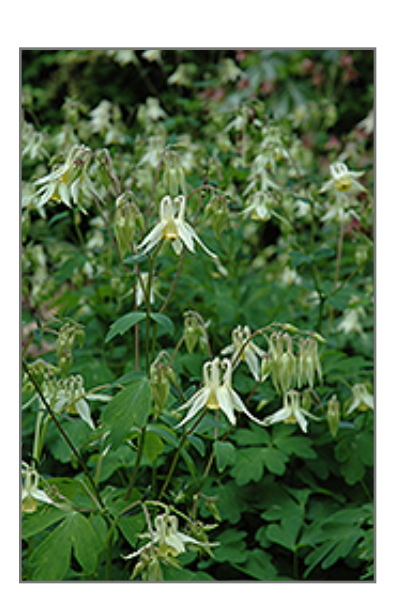
Japanese Columbine flowers

Japanese Columbine features bold nodding white bell-shaped flowers with yellow eyes and white spurs at the ends of the stems from mid spring to early summer. The flowers are excellent for cutting. Its lobed compound leaves remain bluish-green in color throughout the season.