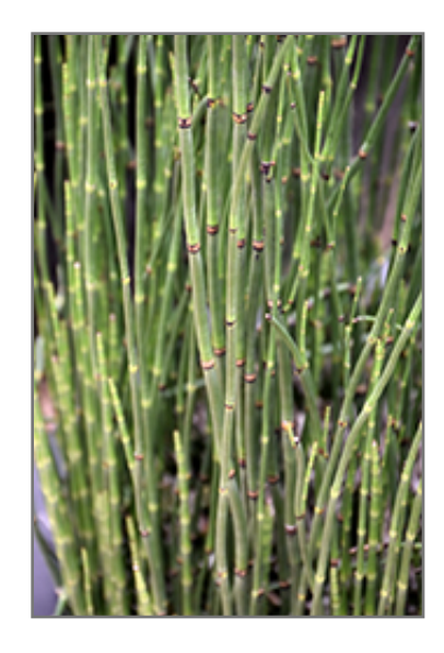
Horsetail foliage