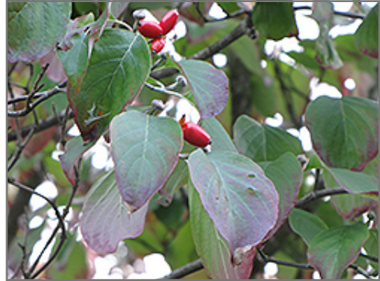
Cherokee Chief Flowering Dogwood fruit

This tree does best in full sun to partial shade. You may want to keep it away from hot, dry locations that receive direct afternoon sun or which get reflected sunlight, such as against the south side of a white wall. It requires an evenly moist well-drained soil for optimal growth, but will die in standing water. It is very fussy about its soil conditions and must have rich, acidic soils to ensure success, and is subject to chlorosis (yellowing) of the foliage in alkaline soils. It is quite intolerant of urban pollution, therefore inner city or urban streetside plantings are best avoided, and will benefit from being planted in a relatively sheltered location. Consider applying a thick mulch around the root zone in winter to protect it in exposed locations or colder microclimates. This is a selection of a native North American species.