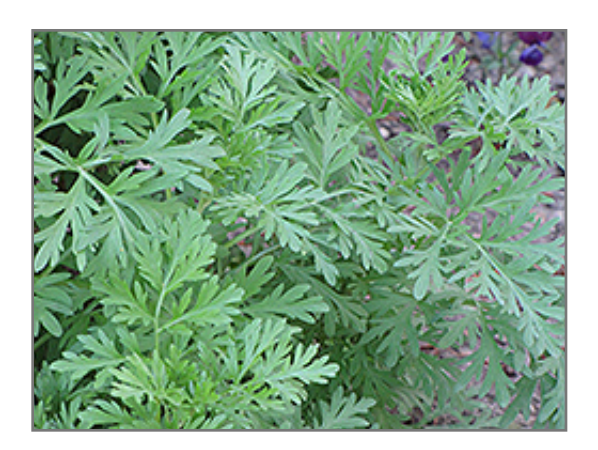
Absinthe foliage

This plant will require occasional maintenance and upkeep, and is best cleaned up in early spring before it resumes active growth for the season. Deer don't particularly care for this plant and will usually leave it alone in favor of tastier treats. It has no significant negative characteristics.