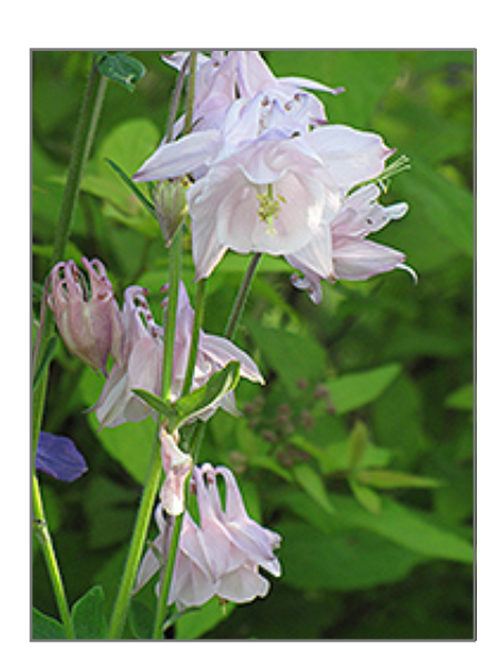
Double Pink Columbine flowers

A unique variation of Colombine, featuring fluffy double flowers of shell pink and white, on stems well above the lacy green foliage mound; wonderful for containers or border edging