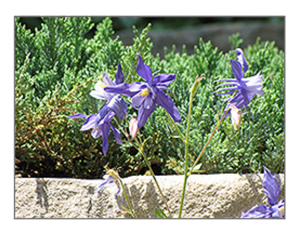
Blue Star Columbine flowers

Elegant deep blue flowers with sky blue edged cups and interesting spurred petals rise over the medium green delicate foliage; a wonderful addition to border edges or massed in the garden; will tend to self seed