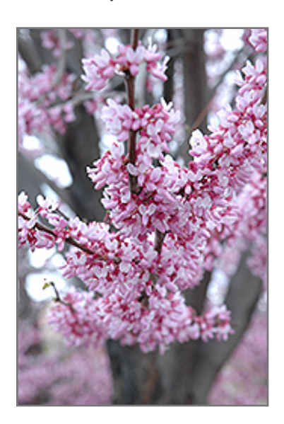
Eastern Redbud flowers