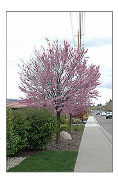
Eastern Redbud in bloom