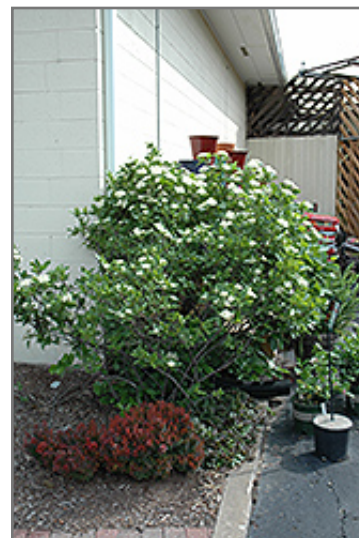
Winterthur Viburnum in bloom