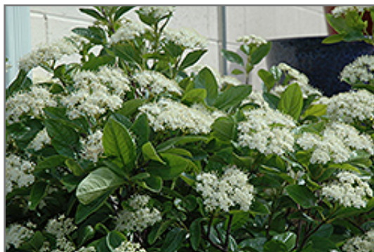
Winterthur Viburnum flowers

Winterthur Viburnum is recommended for the following landscape applications;