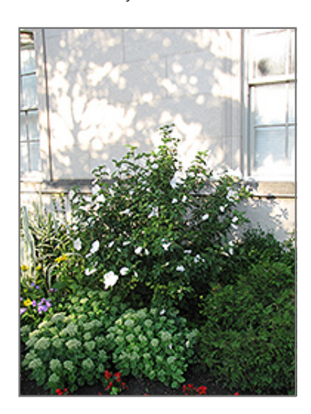
Diana Rose of Sharon in bloom