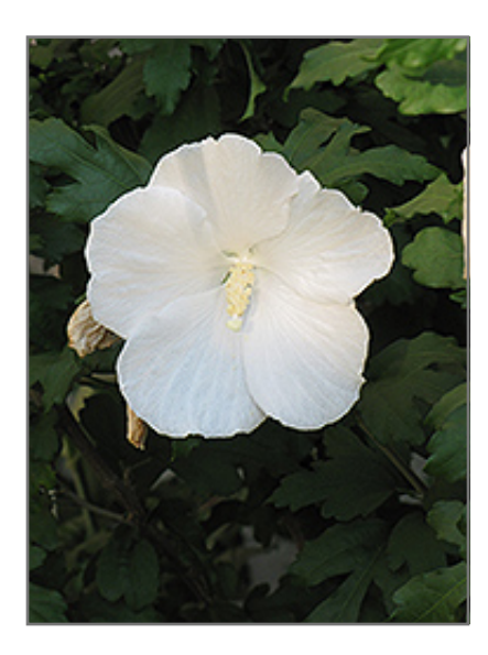
Diana Rose of Sharon flowers

Diana Rose of Sharon is recommended for the following landscape applications;