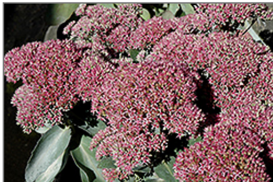
Autumn Delight Stonecrop flowers

This is a relatively low maintenance plant, and is best cleaned up in early spring before it resumes active growth for the season. It is a good choice for attracting butterflies to your yard, but is not particularly attractive to deer who tend to leave it alone in favor of tastier treats. It has no significant negative characteristics.