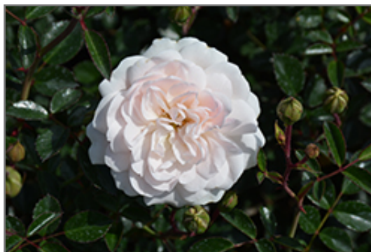
Sea Foam Rose flowers

Sea Foam Rose is recommended for the following landscape applications;