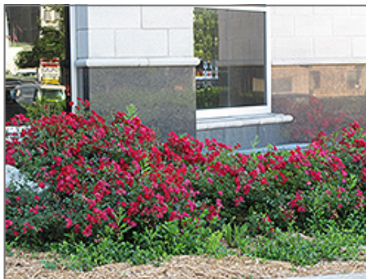
Flower Carpet Red Rose in bloom