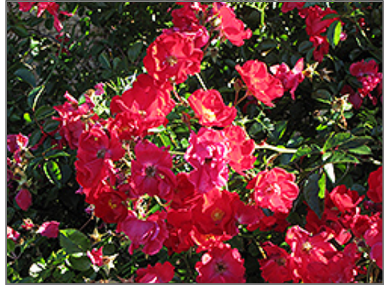
Flower Carpet Red Rose flowers

This shrub should only be grown in full sunlight. It does best in average to evenly moist conditions, but will not tolerate standing water. It is not particular as to soil type or pH. It is somewhat tolerant of urban pollution. This particular variety is an interspecific hybrid.