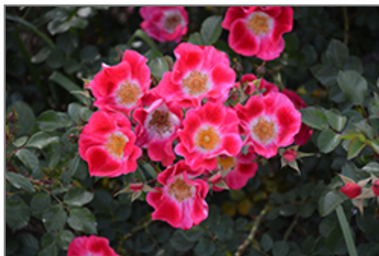
Carefree Spirit Rose flowers

Carefree Spirit Rose is recommended for the following landscape applications;