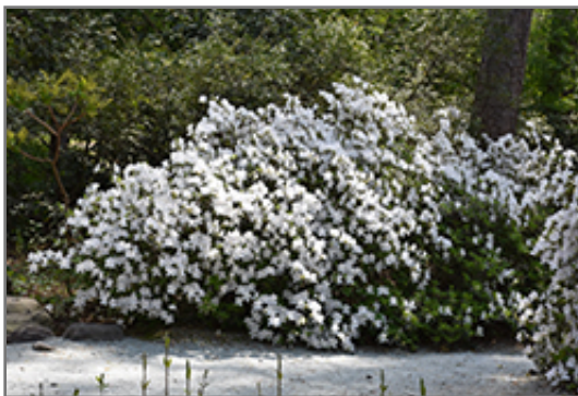
Delaware Valley White Azalea in bloom