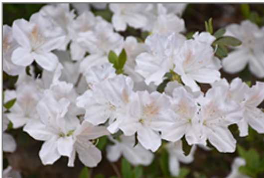
Delaware Valley White Azalea flowers