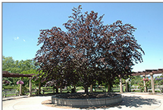
Purple Beech