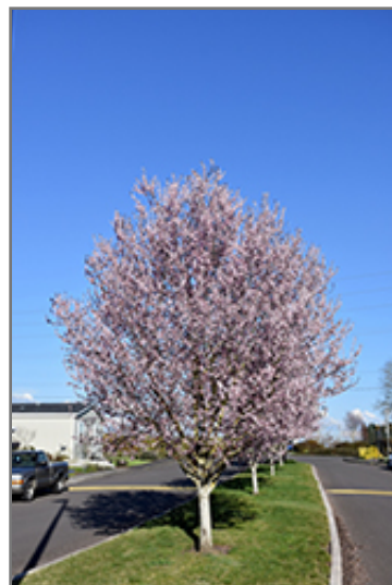
Krauter Vesuvius Plum in bloom