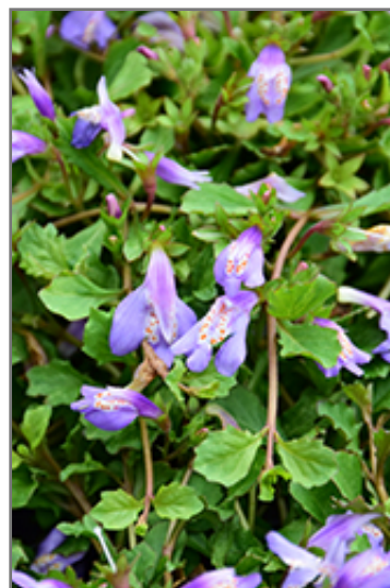
Creeping Mazus flowers