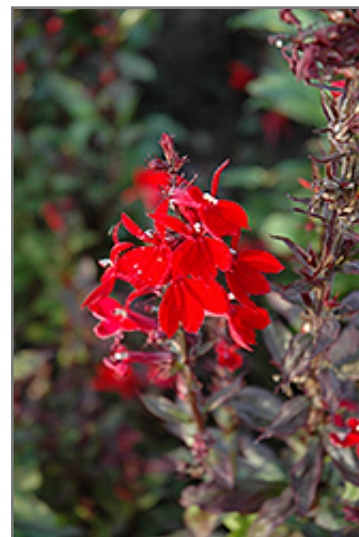
Queen Victoria Lobelia flowers