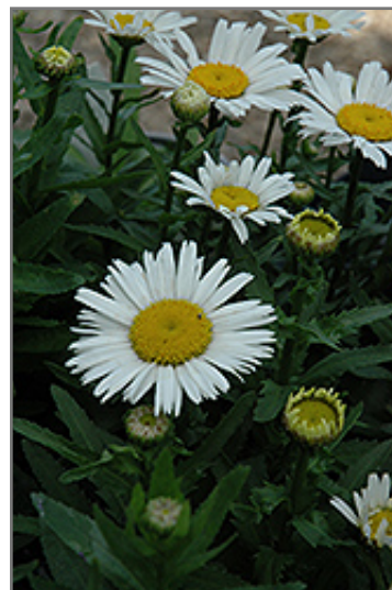
Snow Lady Shasta Daisy flowers