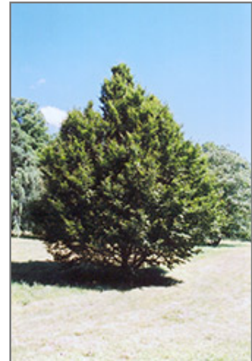
American Hornbeam