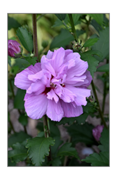
Ardens Rose of Sharon flowers