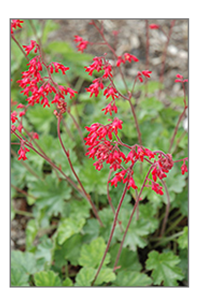
Ruby Bells Coral Bells flowers