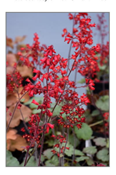
Ruby Bells Coral Bells flowers