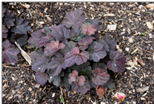
Mocha Coral Bells