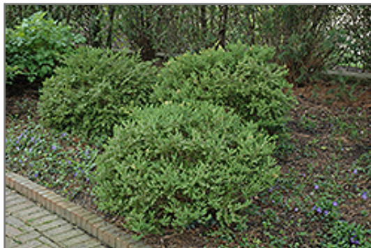
Wintergreen Boxwood