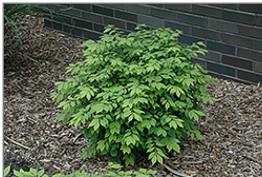
Little Moses Burning Bush