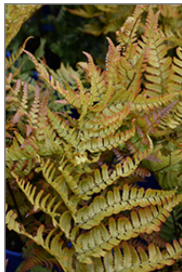
Brilliance Autumn Fern foliage