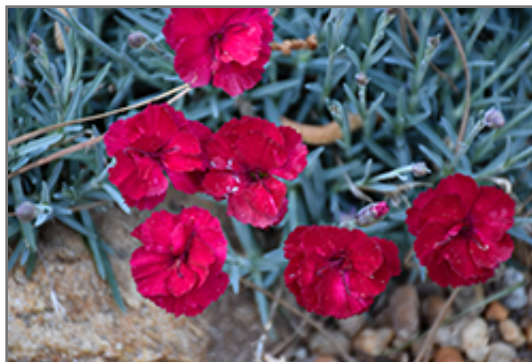
Frosty Fire Pinks flowers