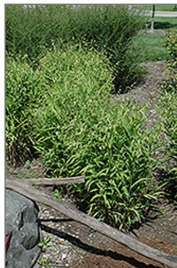
Northern Sea Oats