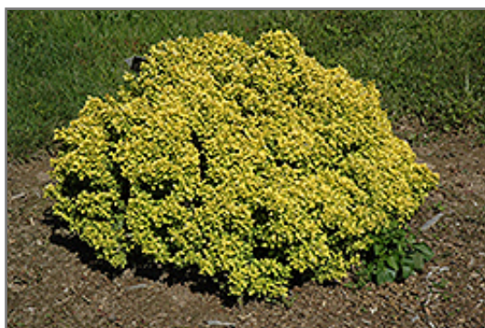
Golden Devine Dwarf Japanese Barberry