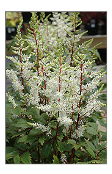
Rock And Roll Astilbe flowers

Striking white colored plumes rising above glossy leaves; perfect in a shady spot with dappled light; prefers moisture so water regularly for abundant flowers and nice foliage