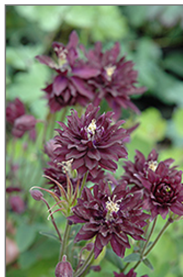
Clementine Dark Purple Columbine flowers