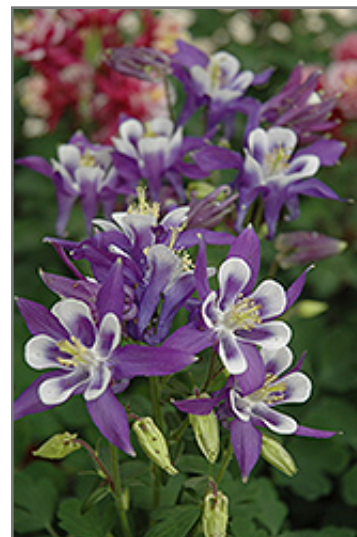
Winky Blue And White Columbine flowers

Winky Blue And White Columbine is recommended for the following landscape applications;