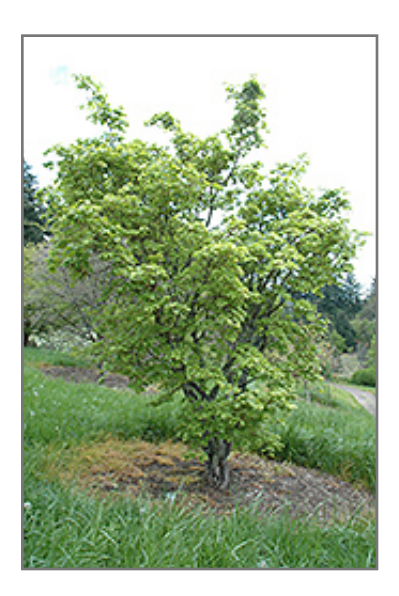
Siebold Maple