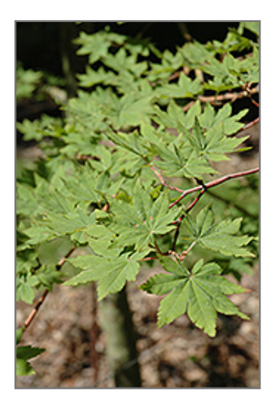
Siebold Maple foliage

This tree does best in full sun to partial shade. It prefers to grow in average to moist conditions, and shouldn't be allowed to dry out. It is not particular as to soil pH, but grows best in rich soils. It is somewhat tolerant of urban pollution. This species is not originally from North America.