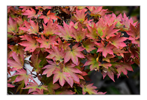
Siebold Maple in fall