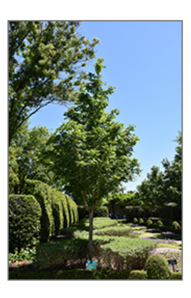
Caddo Sugar Maple