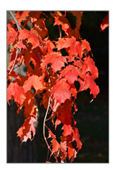
Caddo Sugar Maple in fall