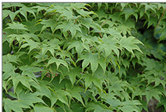
Utsu Semi Japanese Maple foliage