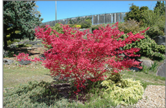
Shindeshojo Japanese Maple in spring

This tree does best in full sun to partial shade. You may want to keep it away from hot, dry locations that receive direct afternoon sun or which get reflected sunlight, such as against the south side of a white wall. It prefers to grow in average to moist conditions, and shouldn't be allowed to dry out. It is not particular as to soil pH, but grows best in rich soils. It is somewhat tolerant of urban pollution, and will benefit from being planted in a relatively sheltered location. Consider applying a thick mulch around the root zone in winter to protect it in exposed locations or colder microclimates. This is a selected variety of a species not originally from North America.