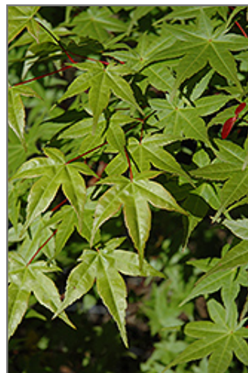
Shindeshojo Japanese Maple foliage