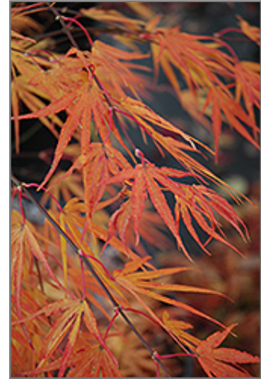
Scolopendrifolium Japanese Maple in fall

Scolopendrifolium Japanese Maple is a fine choice for the yard, but it is also a good selection for planting in outdoor pots and containers. Its large size and upright habit of growth lend it for use as a solitary accent, or in a composition surrounded by smaller plants around the base and those that spill over the edges. It is even sizeable enough that it can be grown alone in a suitable container. Note that when grown in a container, it may not perform exactly as indicated on the tag - this is to be expected. Also note that when growing plants in outdoor containers and baskets, they may require more frequent waterings than they would in the yard or garden.