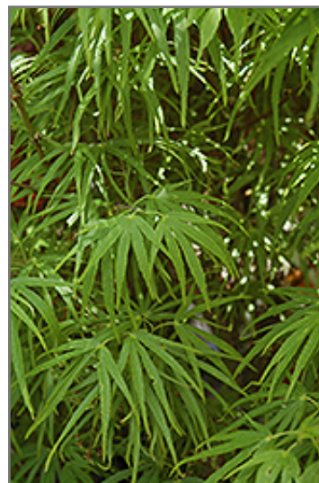
Scolopendrifolium Japanese Maple foliage

Scolopendrifolium Japanese Maple is recommended for the following landscape applications;