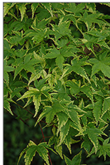
Sagara Nishiki Japanese Maple foliage