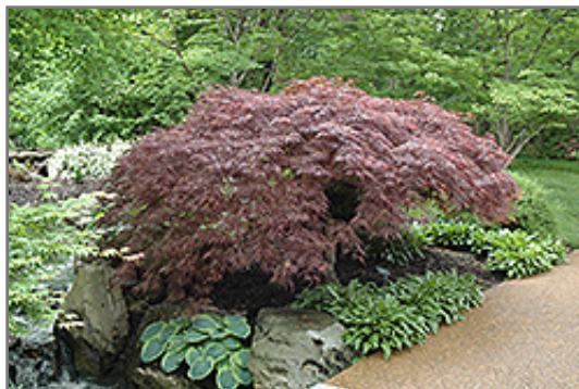
Red Select Japanese Maple