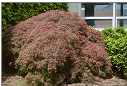
Red Select Japanese Maple