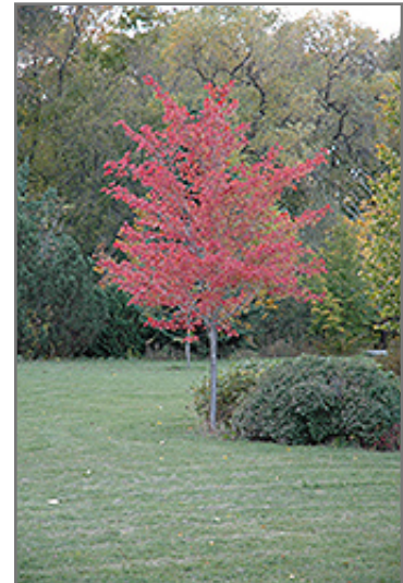
Northfire Red Maple in fall

This tree should only be grown in full sunlight. It is quite adaptable, preferring to grow in average to wet conditions, and will even tolerate some standing water. It is not particular as to soil type, but has a definite preference for acidic soils, and is subject to chlorosis (yellowing) of the foliage in alkaline soils. It is somewhat tolerant of urban pollution. This is a selection of a native North American species.