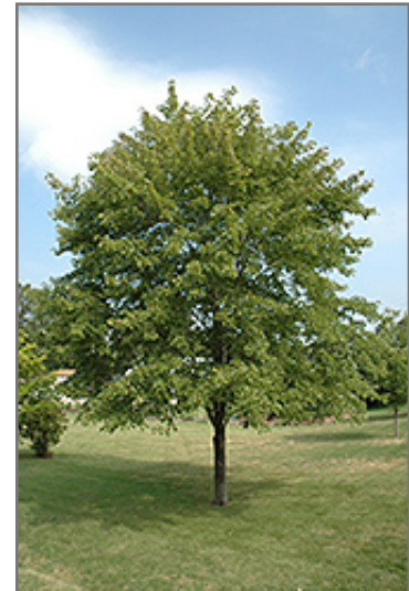
Northfire Red Maple