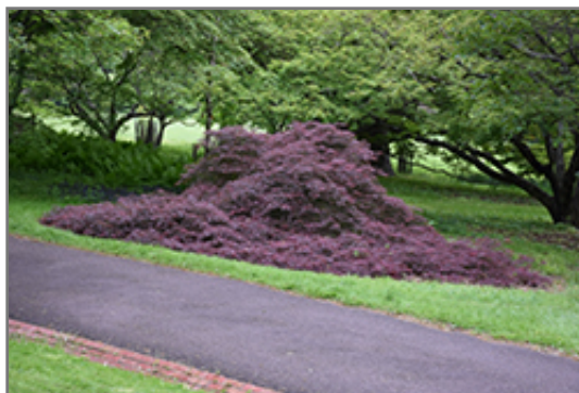
Garnet Cutleaf Japanese Maple